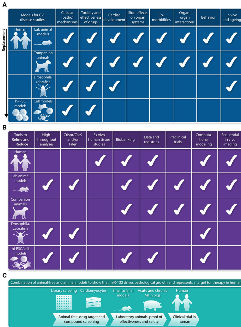
Figure 1 (A) Models that are available for studies on cardiovascular disease, ranging from human and laboratory animals to stem cell-derived models. Aspects that can be measured currently in the different models are indicated with the white check mark. This overview shows that several models allow to reduce the number of studies in laboratory animals, as many initial steps in identification of pathomechanisms, testing drug toxicity and drug effectiveness can be studied in cell-based models. Clearly, studies in human itself offers multiple opportunities to reduce the work in laboratory animals. (B) Multiple tools have been developed in past years to refine and replace studies in the models used for cardiovascular research, and range from tools and expertise to characterize human tissue samples obtained during surgery to models derived from hiPSCs (human induced pluripotent stem cells). (C) Example of an experimental design making use of available complementary research models based on the 3R principles. 2

pathways triggered by the initial cardiac injury. This includes CM remodelling and alteration of metabolism, followed by progressive LV dilatation (eccentric remodelling), associated with extensive remodelling of the